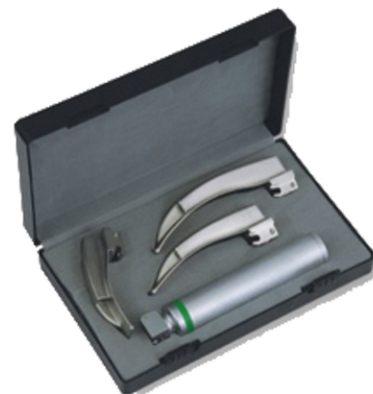
Hand Case Laryngoscope Packing Code STD:153