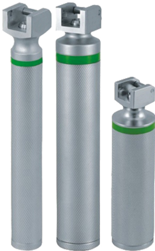
Small Medium Stubby