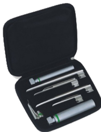
Zipper Box Laryngoscope Packing Code STD:152