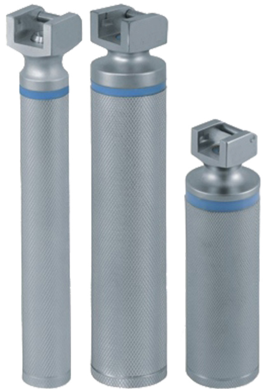
Small Medium Stubby