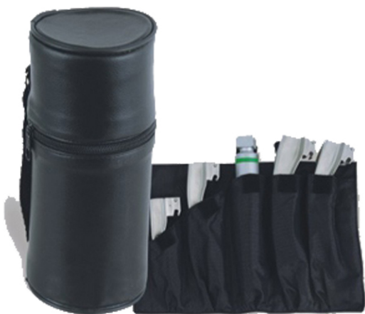
Zipper Bottle Laryngoscope Packing Code STD:151