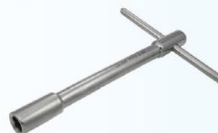
Box Spanner 11mm