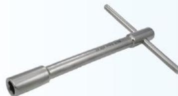
Box Spanner 8mm