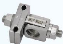
A. O. Type Double Pin Clamp 4.5mm x 11mm