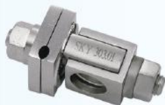
A. O. Type Clamp (Single Pin) 4.5mm x 11mm