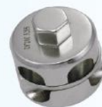
Aesculap Clamp 4mm x 4mm