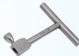
"T" Handle For Schanz Screws / Steinman Pin