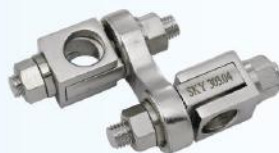
A.O. Joint For Two Rod 11 x 11mm