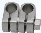
Tube to Tube Clamp 11 x 11mm