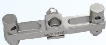
Transverse Pin Adjusting Clamp