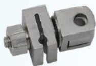
A. O. Type Clamp 2.5mm x 4mm