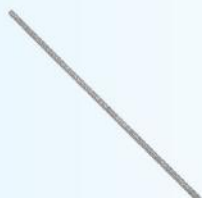
Jess Rod With Serration