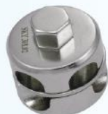
Rod To Rod Clamp 8mm x 8mm