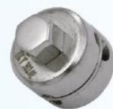
Aesculap Clamp 2.5mm x 4mm