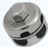
Aesculap Clamp 4.5mm x 8mm