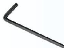
L & Key