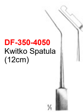
DF-350-4050 Kwitko Spatula (12cm)