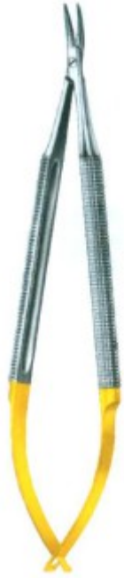
TCF-04-13 Barraquer Needle Holder (15cm)