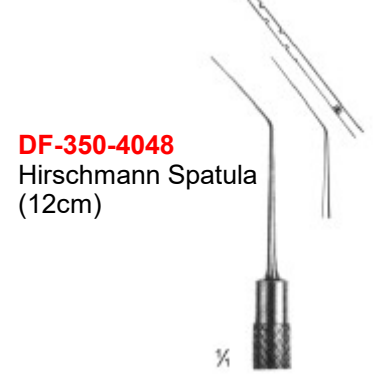
DF-350-4048 Hirschmann Spatula (12cm)