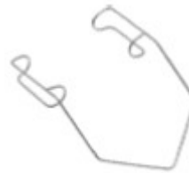
DF-333-3778 Barraquer Adult size (4cm)