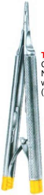
TCF-04-13B Castroviejo Needle Holder with lock (12.5cm)