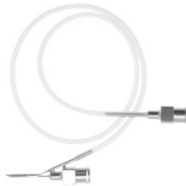
FSI-SIC-23 Simcoe Irrigation Cannula 23 gauges