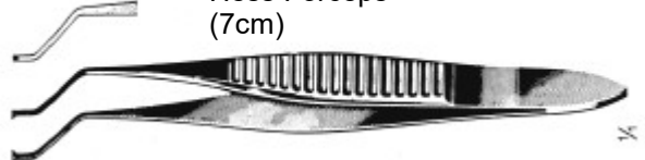
DF-362-4239 Hess Forceps (7cm)