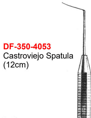
DF-350-4053 Castroviejo Spatula (12cm)